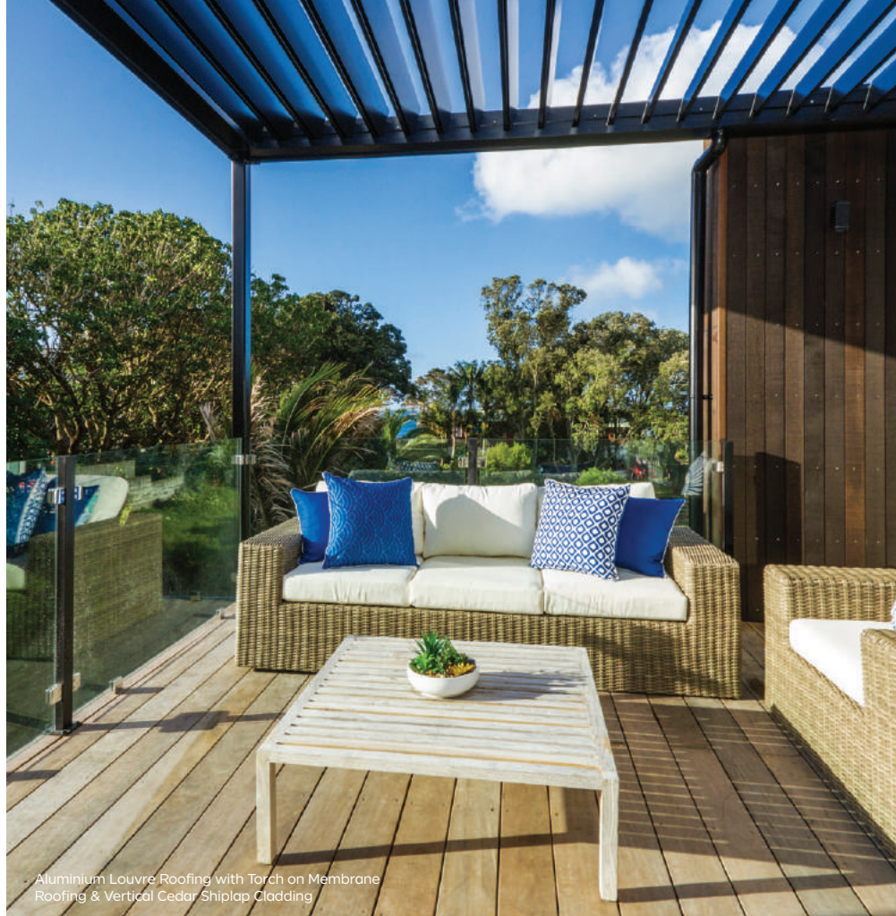
Aluminium Louvre Roofing with Torch on Membrane Roofing & Vertical Cedar Shiplap Cladding